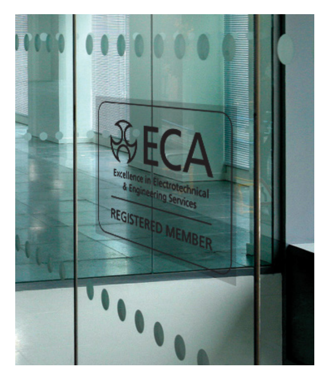
ECA Window Sticker white transparent